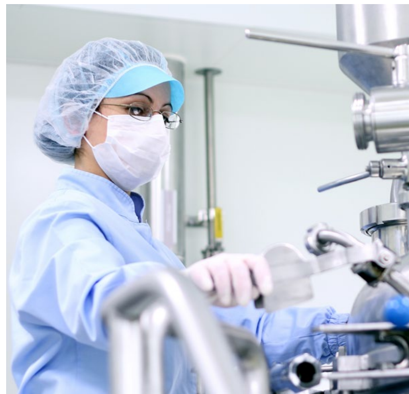
AirWATCH monitors airborne emission levels from manufacturing facilities.