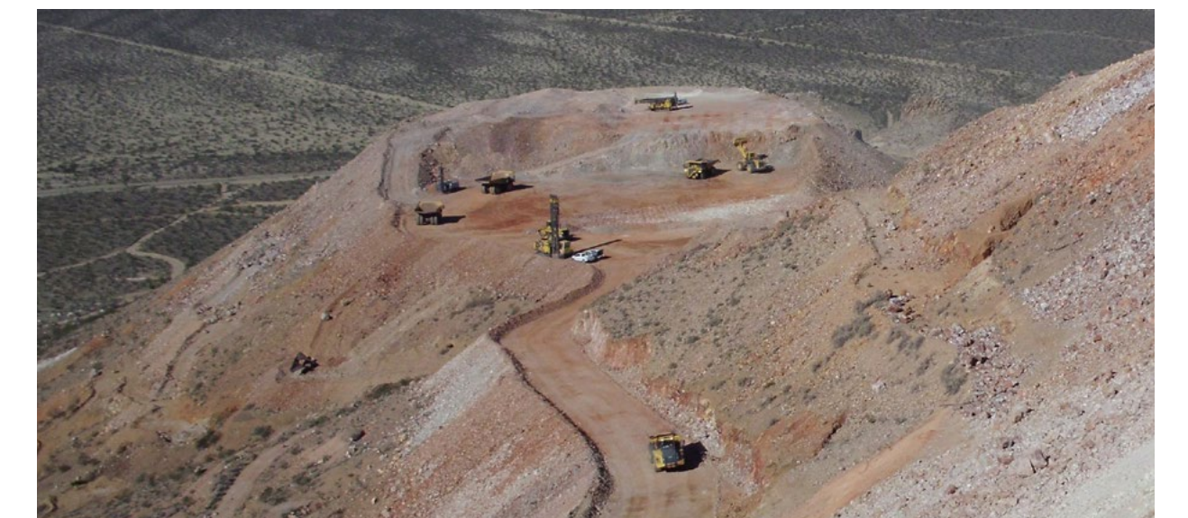
AirWATCH can track airborne dust from mining operations.

Often to meet regulatory and ESG related requirements, there is a need to mitigate current emission levels. In measuring, monitoring, and managing this data, operations can develop solid plans to implement operational changes, including swapping out equipment, scaling programs across multiple sites/operations, or changing internal practices. These actions contribute to a cleaner atmosphere, can address regulatory requirements, and create cost savings.